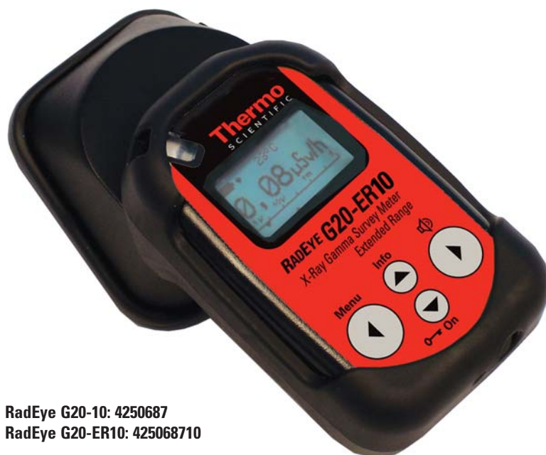
RadEye G20-10: 4250687 RadEye G20-ER10: 425068710

The RadEye G20-10 and G20-ER10 are excellent gamma survey meters with a flat energy response curve from 17 keV to 1.3 MeV according to ambient equivalent dose H^*(10) . The RadEye G20-ER10 model covers the whole dose rate range from background to 100 mSv/h.